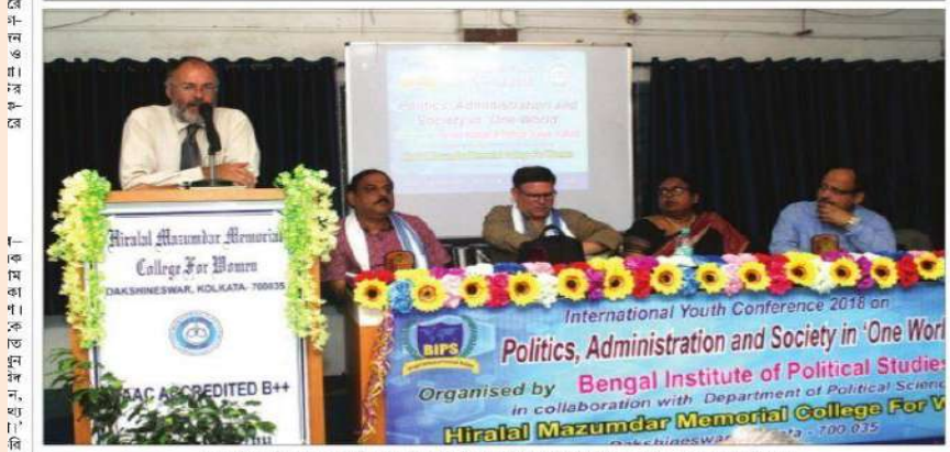
বেঙ্গল ইনস্টিটিউট অফ পলিটিক্যাল সাইন্সের উদ্যোগে ইন্টারন্যাশনাল ইয়ুথ কনফারেন্স ২০১৮ অনুষ্ঠিত হল মকিমেশ্বর হীরলাল মজুমদার মেমোরিয়াল কলেজে।