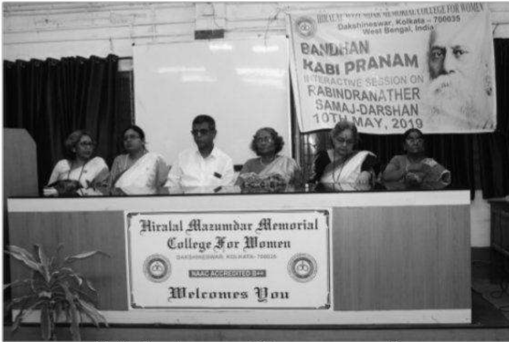
বিশ্বকবি রবীন্দ্রনাথ ঠাকুরের সমাজ দর্শন নিয়ে এক আলোচনা সভা অনুষ্ঠিত হল দক্ষিণেশ্বর হীরালাল মজুমদার মেমোরিয়াল কলেজে।