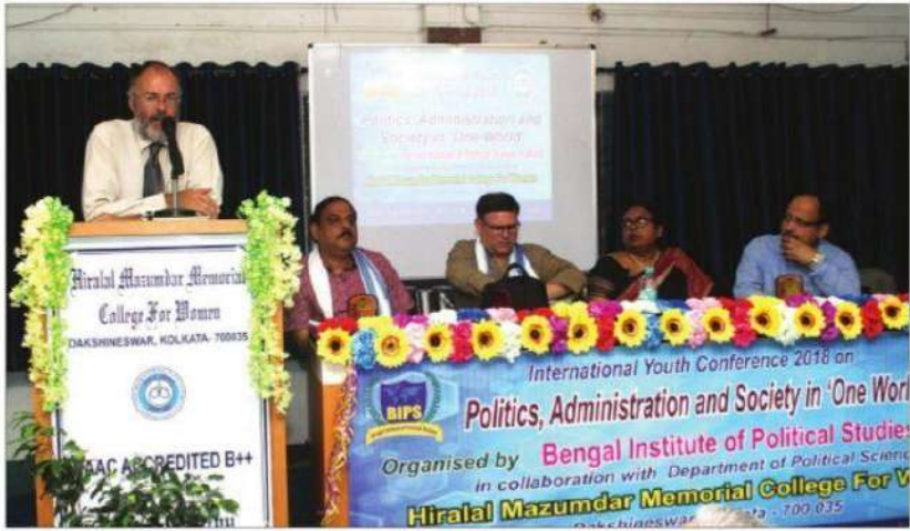
বেঙ্গল ইনস্টিটিউট অফ পলিটিক্যাল সাইন্সের উদ্যোগে ইন্টারন্যাশনাল ইয়ুথ কনফারেন্স ২০১৮ অনুষ্ঠিত হল দক্ষিণেশ্বর হিরালাল মজুমদার মেমোরিয়াল কলেজে।